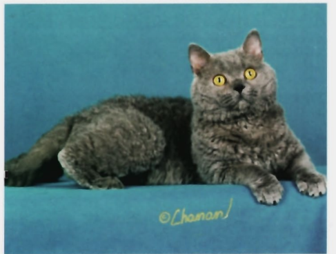
GC BW Pamac's Winnie The Blue, a blue shorthair male The Northwest Region's 2nd Best of Breed, 2002 Also CFA's and the Northwest Region's Best of Breed, 2001 Br Pamela Sharp Ow Pamela Sharp and D Bass