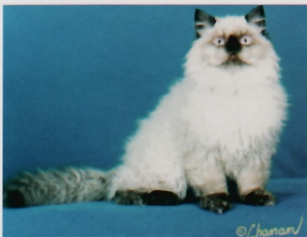
Pamac's Calypso, a seal smoke point longhair male CFA's 3rd Best of Breed, 2001 Br/Ow Pamela Sharp