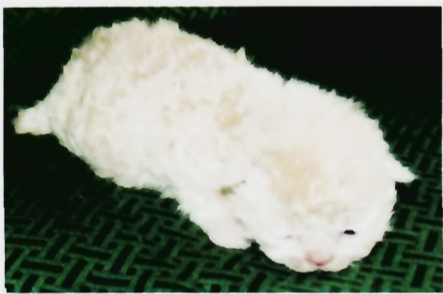
Selkirk Rex kitten at 6 days of age, a Nite Wind cream longhair, born June 9, 2002