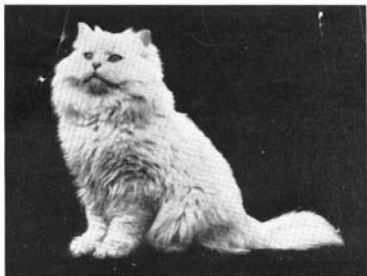
CUPID OF HYVER