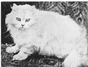
SILVER DONNA Chinchilla Female

Both pale Chinchillas, green eyes and no leg bars or cream. All letters cheerfully answered.