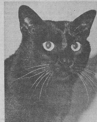
Ch PEERLESS SUKOVA (5 CCs)