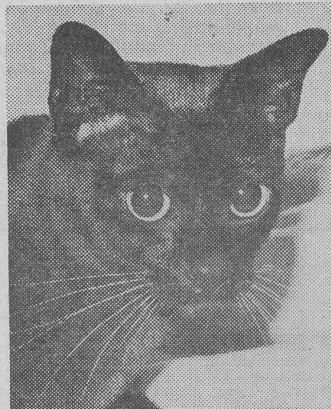
Ch PEERLESS SARALA (3 CCs)