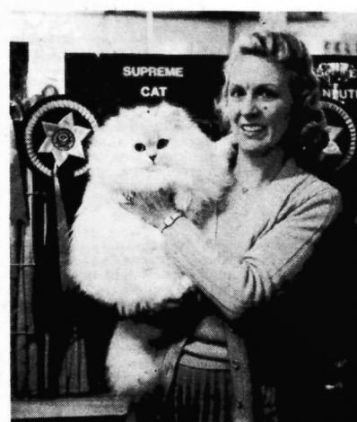
Supreme Champion was a Chinchilla, Ch Snowbloom Ja'bin, owned by Mrs K Evans of Westcliff-on-Sea.

On this floor was sited, also the central stage which later was manned by the supreme best in show judges and throughout the day served as a control centre and a separate bar for the exclusive use of judges, stewards and show officials as well as the judges' changing room. The whole hall was splendidly warm and except in one or two places, the lighting was adequate.