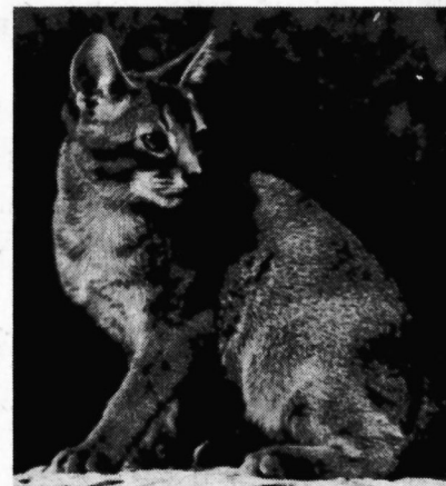
TAISHUN BACCHUS

The Abyssinian is an extremely friendly animal, highly intelligent, and has a personality of its own and with its short fine coat is very easy to groom.