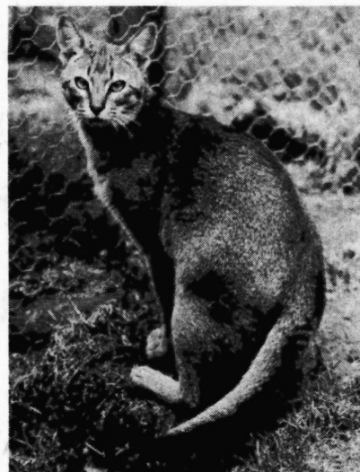
CH TAISHUN LEO

Colourpoint to Colourpoint, Birman to Birman, Turkish to Turkish. There should be no out crossing once a breed is established. Of course we will always have good, bad and indifferent but this is normal and our top cats will be top if the right pedigrees are used. Breeding tells.