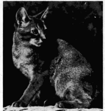
TAISHUN BACCHUS

The Abyssinian is an extremely friendly animal, highly intelligent, and has a personality of its own and with its short fine coat is very easy to groom.